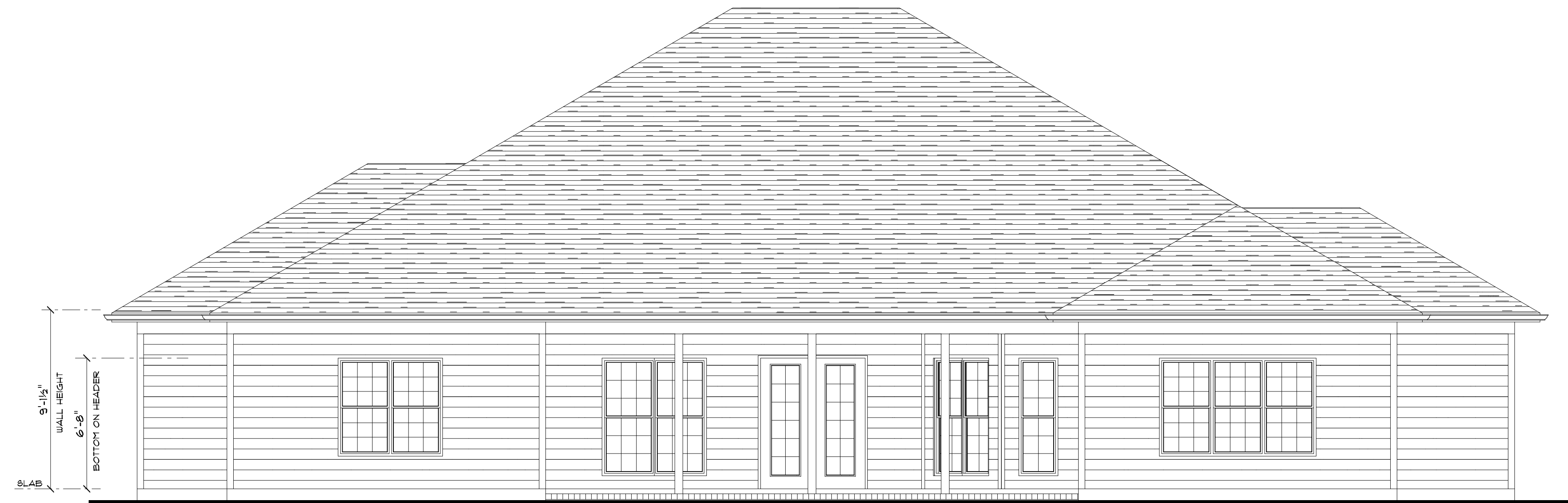
REAR ELEVATION SCALE: 1/4"=1'-0"

DATE: March 03, 2010 REVISION NAME: FILE NAME: Lauren Pines